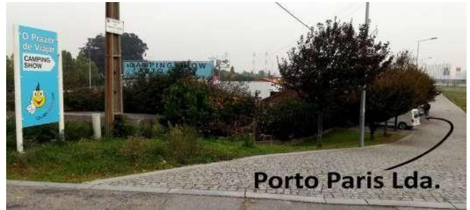
Porto Paris Lda.