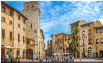
Colle di Val d'Elsa