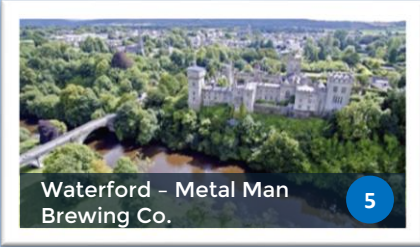
Waterford - Metal Man Brewing Co.