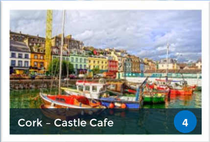
Cork - Castle Cafe