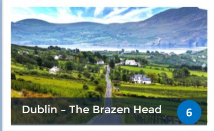
Dublin - The Brazen Head