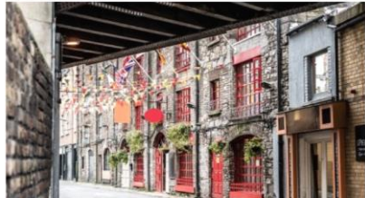
Dublin - Guinness Brewery