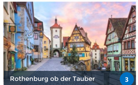
Rothenburg ob der Tauber