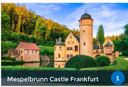
Mespelbrunn Castle Frankfurt