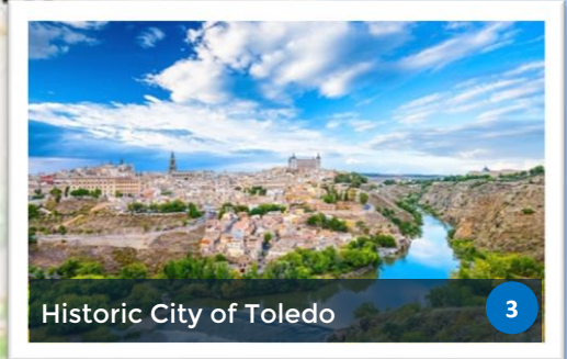
Historic City of Toledo