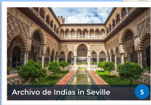
Archivo de Indias in Seville