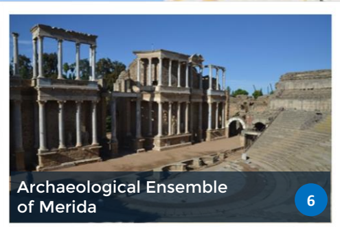
Archaeological Ensemble of Merida