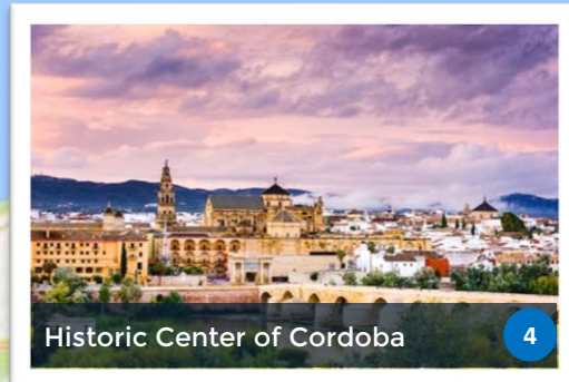
Historic Center of Cordoba