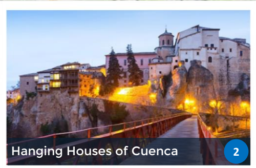
Hanging Houses of Cuenca