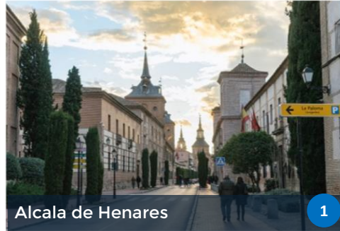
Alcala de Henares